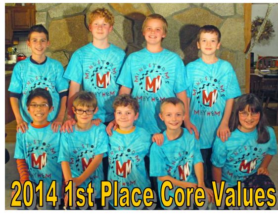
"FLL is a very social process that requires ingenuity, critical thinking, and collaboration. These are the very skills that

Since 2002, Mindstorms Mayhem, a FIRST LEGO League (FLL) youth robotics team, has consistently impressed tournament judges at state and international competitions with their quality research projects. sophisticated design principles, and advanced programming of their robots. They have been an inspiration and role model to other teams.